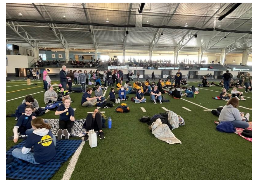
Michigan Science Olympiad Region 12 Competition Saturday, March 23, 2024