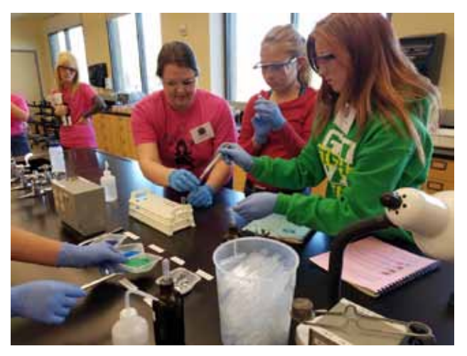
Girls analyze blue crystals found at the crime scene using visible spectrophotometry.