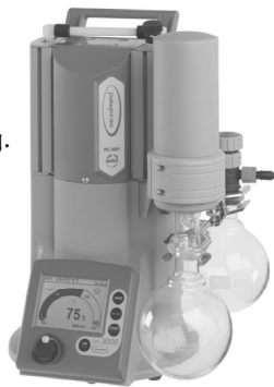
The VACUUBRAND PC3001 1.5 Torr, 27 lpm