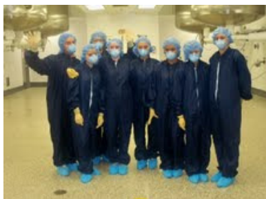
Grifols CSULB SMACS Tour