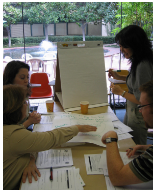
ACS Leadership Workshop