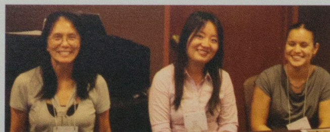
L. Paw U volunteers for panel, representing young women chemists.